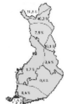
The share of protected forests per forest vegetation zone