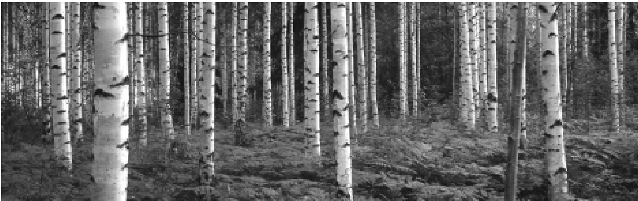
Birch trees, North Carelia, Finland.