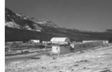
Chevron K-29 Gas Complex near Fort Liard, Northwest Territories, 2001.

Environmental groups say large swaths of boreal forest and taiga in the Mackenzie Valley would be clear-cut during pipeline construction, fragmenting the habitat of grizzly bears, woodland caribou and wolves and prejudicing the creation of protected areas. Seismic lines, winter roads and pipelines would tunnel under or cross more than 500 rivers and streams. Six internationally recognized Important Bird Areas along or near the